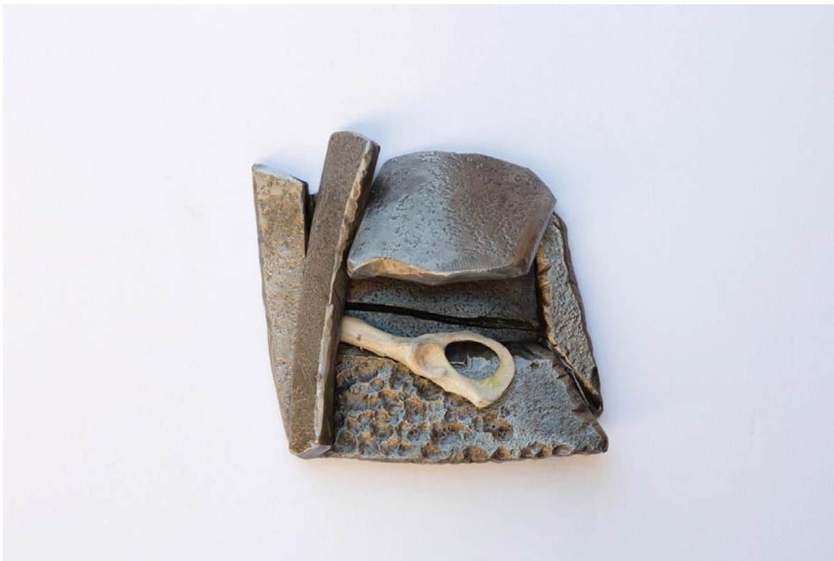
14.5 x 13 x 5.5 cms. Waxed steel and bone.