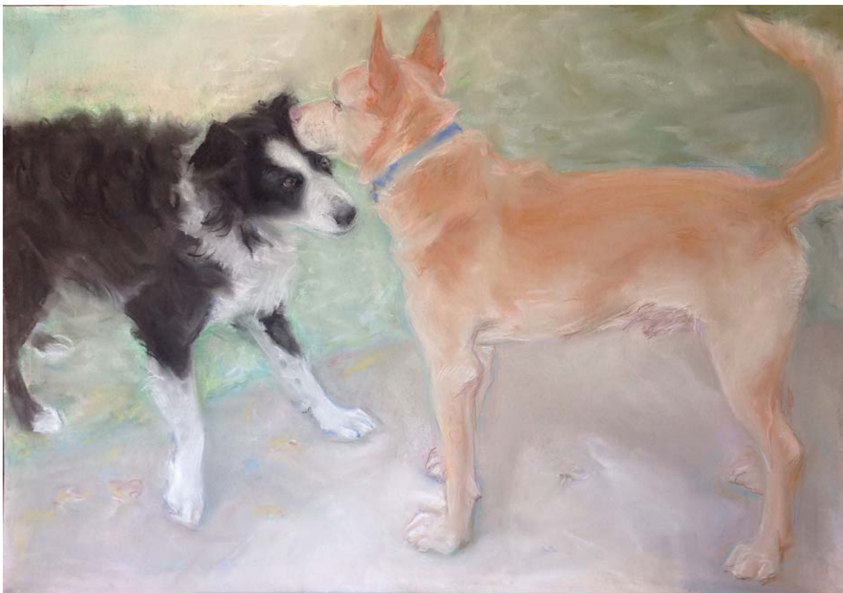
68 x 97cm. Pastel on paper