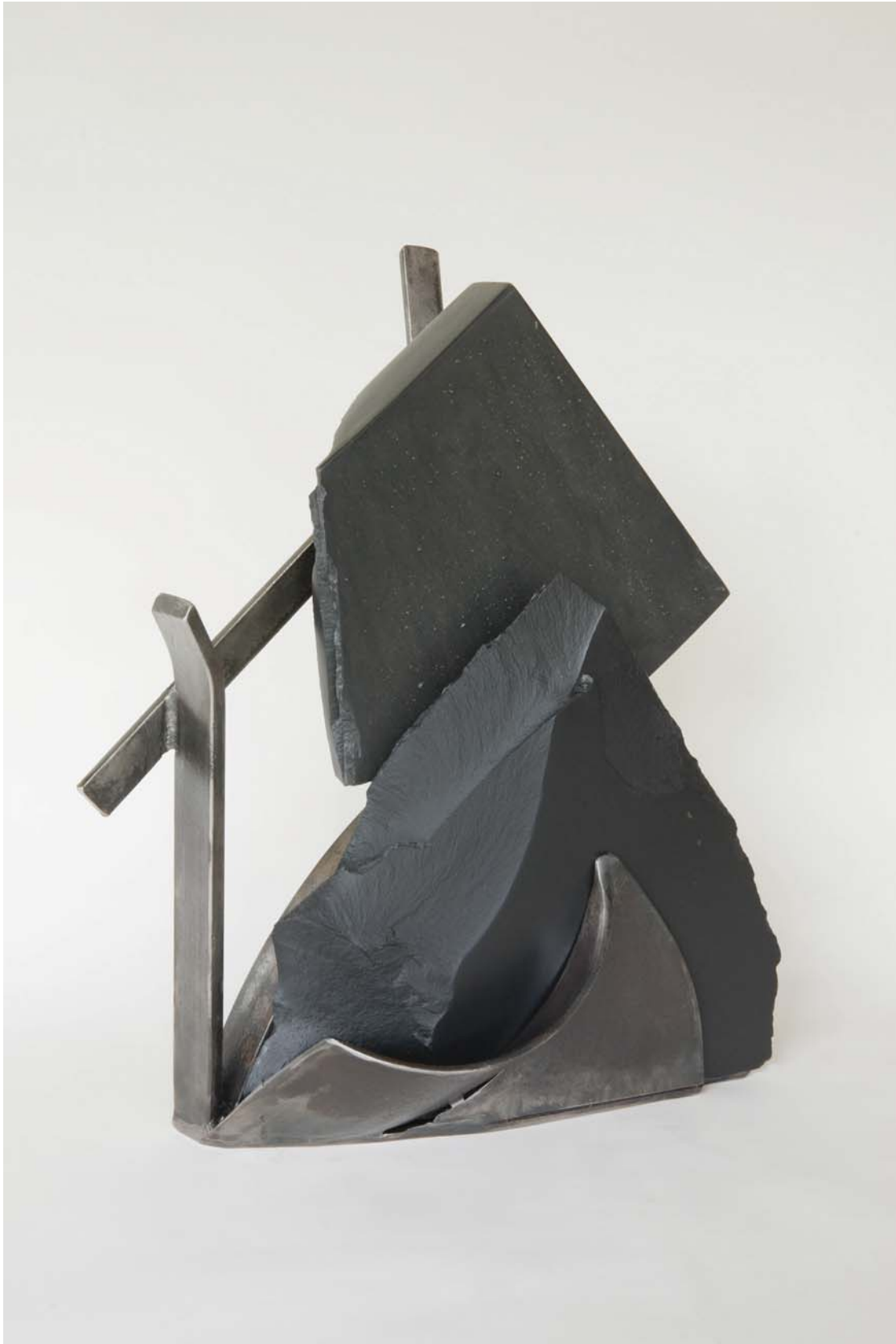
41 x 19 x 30 cms. Waxed steel and slate.