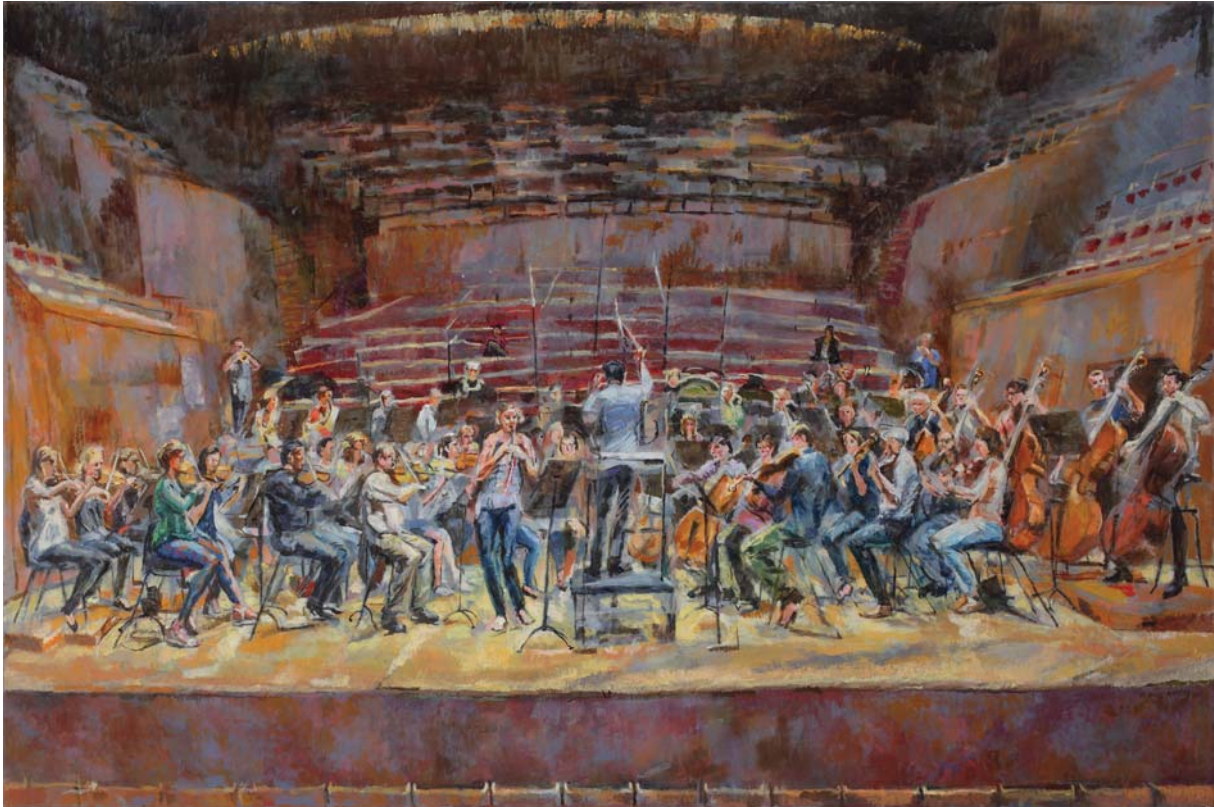
95.1 x 137cm. Oil on polyester.