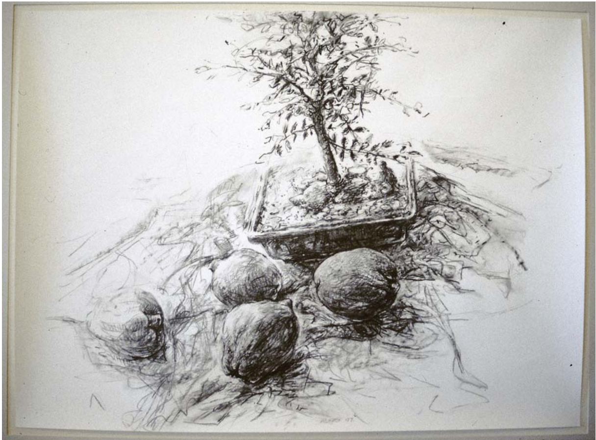
56 x 76 cm. Charcoal on Kent.