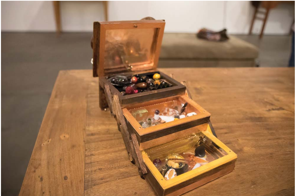
18 x 14 x 28cm. Mixed media.