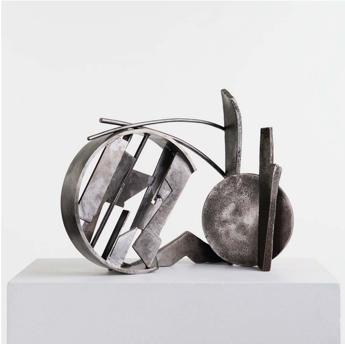
30.5 x 37 x 15.5 cms. Waxed steel.